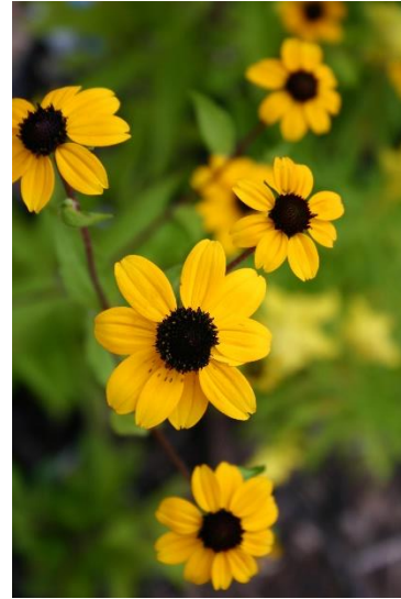
Brown Eyed Susan