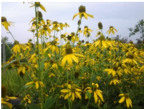
Gray Headed Coneflower