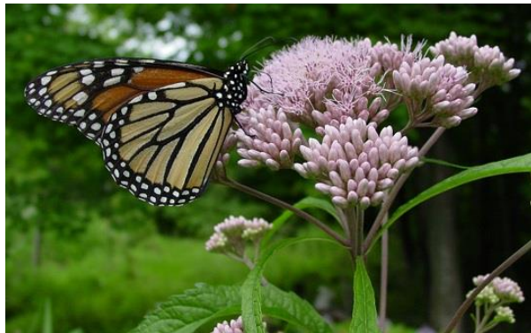
Joe Pye Weed