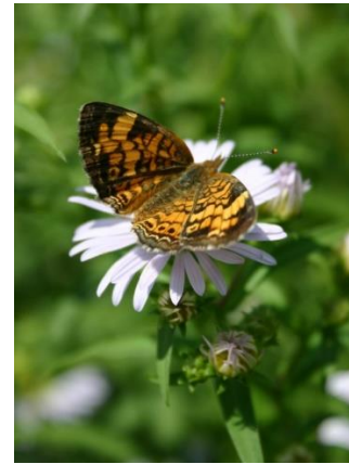
New England Aster