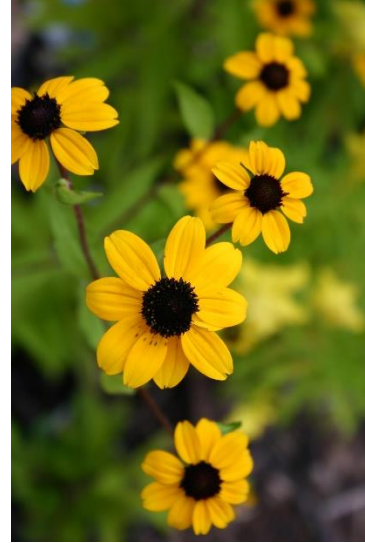
Brown Eyed Susan